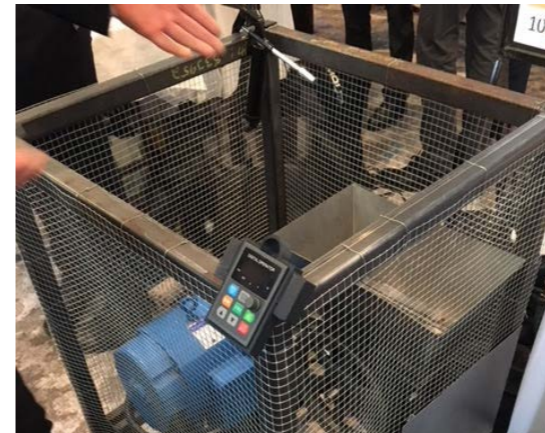
Abrasion & Wear