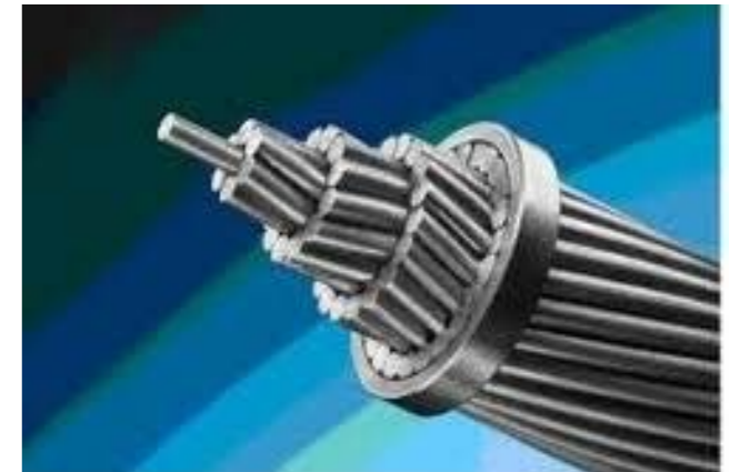
Thermal Conductivity (August 2019)